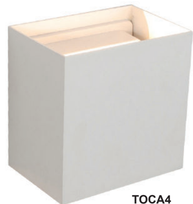
TOCA4 (Matt white)