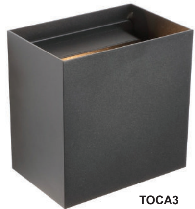
TOCA3 (Matt black)