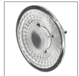
Additional 60° lens is included in the package