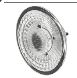
Additional 60° lens is included in the package